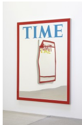
3 Mungo Thomson, October 13, 1975 (Meditation: The Answer to all Your Problems?) , 2013.