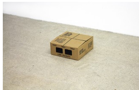
7 Mungo Thomson, Cricket Duet for Flute and Violin , 2013.