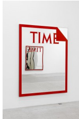
2 Mungo Thomson, March 23, 1987 (The Nature of the Universe) , 2013.