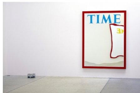
8 View of Mungo Thomson, Galerie frank elbaz, Paris, 2013.