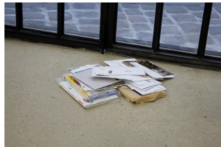
4 Mungo Thomson, Mail , 2013.