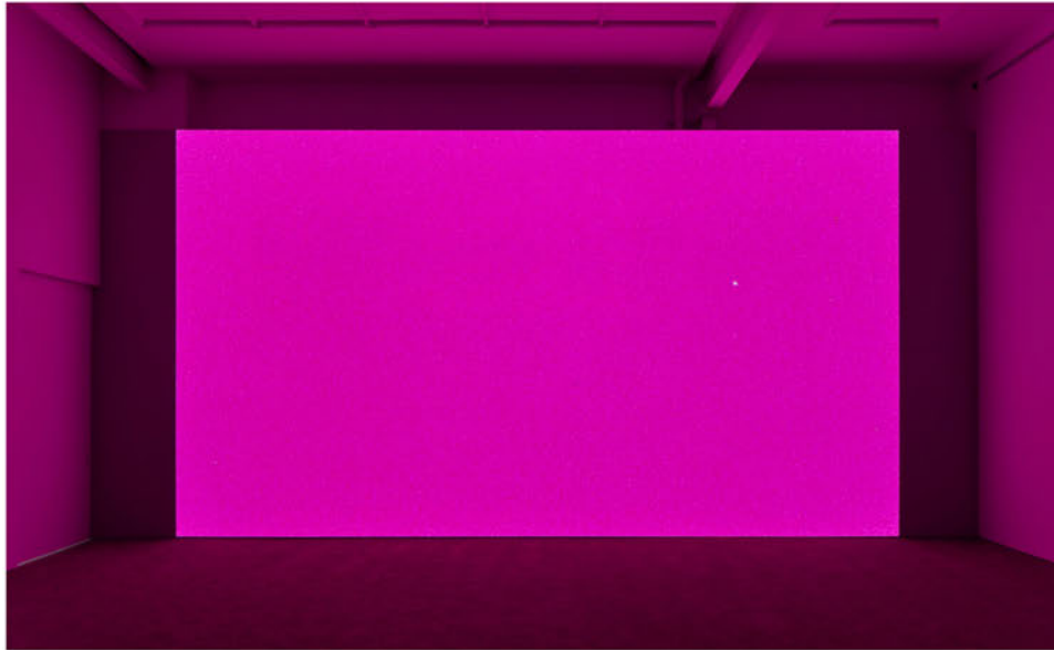
Installation view, Mungo Thomson, "Volume 7. Color Guide" (2021-22), 4K video with sound, 4:30 minutes. Original Score by Adrian Garcia

In the spirit of Time-Life books, each of Thomson's video volumes brings an encyclopedic scope to a single theme, such as flowers, search-engine-style questions, and knot-tying (the latter a metaphor, perhaps, for the Gordian knot of Thomson's inquiry). "Volume 2. Animal Locomotion" (2015-22), aptly titled after Eadweard Muybridge's proto-stop-motion experiments with motion photography, plucks images from fitness how-to books to depict individuals moving flip-book-style through lunges and squats, dance moves, and yoga poses — including yoga performed at desks. In a similar vein as Foods of the World's copyright sign, which wordlessly evokes the intellectual property issues accompanying digitization, the predominant Whiteness of the bodies throughout "Animal Locomotion" implicitly gestures toward the data biases that feed algorithmic racism.