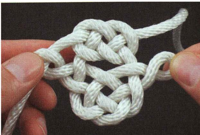
Still from Mungo Thomson, Volume 6. The Working End , 2021–22, digital video with sound, 5 minutes, 51 seconds. Music by Pauline Oliveros, "Single Stroke Roll Meditation," 1974, PoPandMoM Publications—All Rights Reserved.