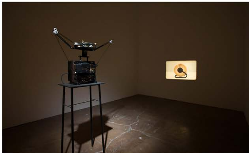
Mungo Thomson, Untitled (Margo Leavin Gallery, 1970- ) , 2009, Super-16mm film, color, silent, 5 minutes, 11 seconds. Installation view, Mungo Thomson: Time, People, Money, Crickets , SITE Santa Fe, Santa Fe, New Mexico, 2013.

If books are just being scanned by high-speed book-scanning robots to become PDFs for the internet, what happens to the book object? I chose a high-speed book-scanning robot in Tokyo, which is the fastest in the world, as a sort of template for the project. It scans books at a rate of eight pages a second, but in doing so it destroys the book. So it really is a transformation of states. It goes from being a solid to a gas in a sense. It becomes data in that moment. And for me, that was a really rich transformation. And there was this way of thinking about that scanner as a filmmaking apparatus. It's going fast enough that it begins to trick the mind into seeing motion from these stills. And that's the same illusion that stop-motion produces.