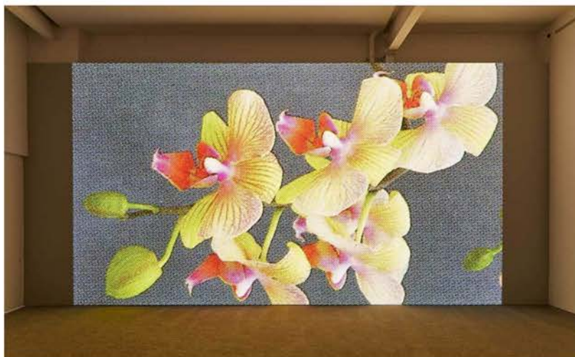
Mungo Thomson, Volume 3. Flowers (Nahbild) , 2015–22, digital video with sound, 10 minutes, 8 seconds. Music by Sven-Åke Johansson, “Nahbild,” 1972. Installation view of Mungo Thomson: Time Life , Karma, New York, 2022.

Videos that document encyclopedic knowledge.